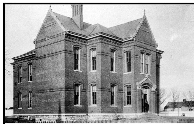
Old Meigs Building